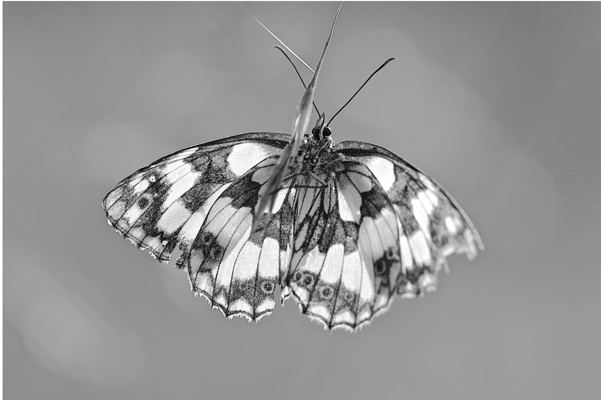
PLATE 1. Some individuals of marbled white ( Melanargia galathea ) look quite worn as it is a species with a relatively long flight period.

this led to mean first observations from all study plots that were generally later than the estimated mean dates of population arrivals from our model (Appendix A: Fig. A4).